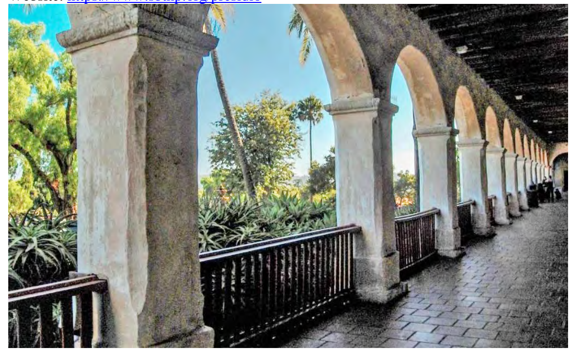
El Presidio de Santa Barbara