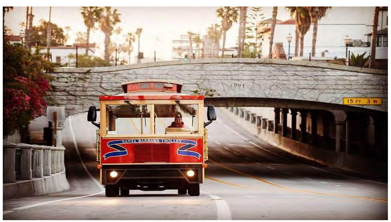
Santa Barbara Trolley Tour