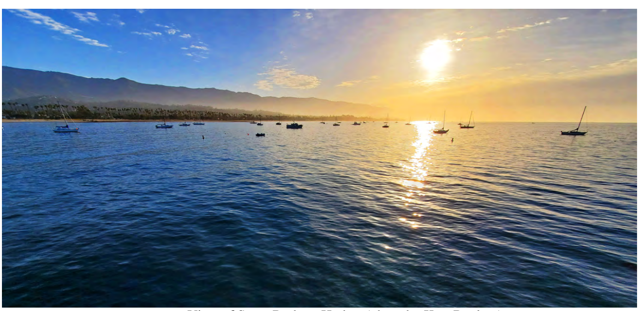
View of Santa Barbara Harbor

PSOC will be staying at the SANDPIPER LODGE located at 3525 State Street, Santa Barbara, CA 93405. For room reservations, please call (805) 687-5326. PSOC reserved a block of 15 rooms (8 king and 7 double queen). For the Deluxe King Bed , the total for 3 nights is $589.38 (taxes included) . For the Deluxe 2 Queen Beds , the total for 3 nights is $623.58 (taxes included) . When making your room reservation, be sure to tell them you are with PSOC so you can get our special group rate. The PSOC block of rooms will be available to members until March 31, 2024. You can cancel your reservation without penalty up to 48 hours before arrival. A continental breakfast is served daily from 6:30-10:00 am. Heated pool/spa and fitness center. Check-In: 3:00 pm / Check-Out: 11:00 am. Sandpiper Lodge website: <a href="www.sandpiperlodge.com">www.sandpiperlodge.com</a>