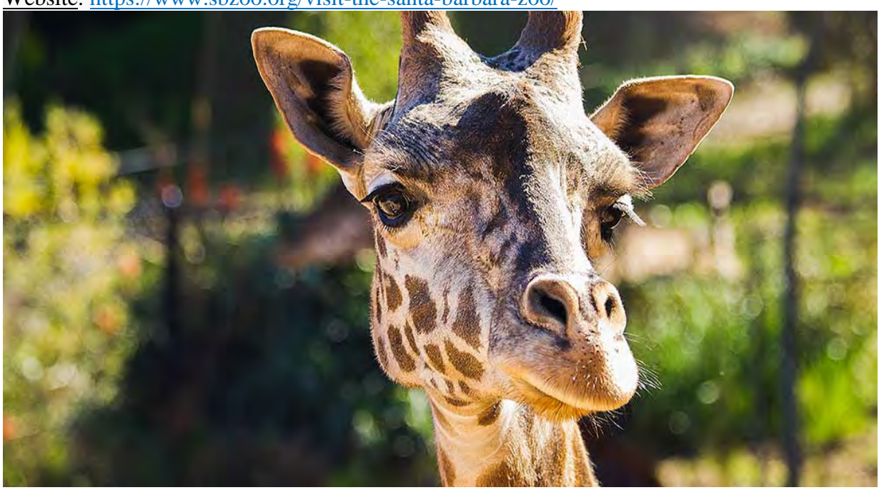
Santa Barbara Zoo

Website: https://www.sbzoo.org/visit-the-santa-barbara-zoo/