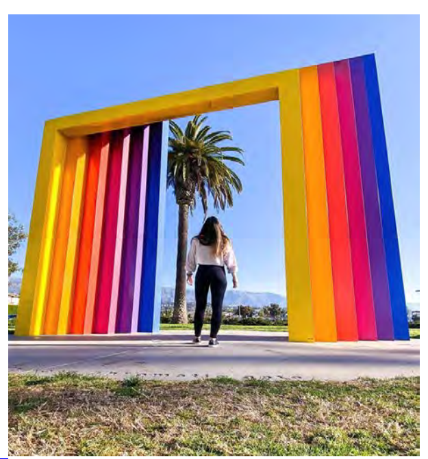
Santa Barbara Chromatic Gate