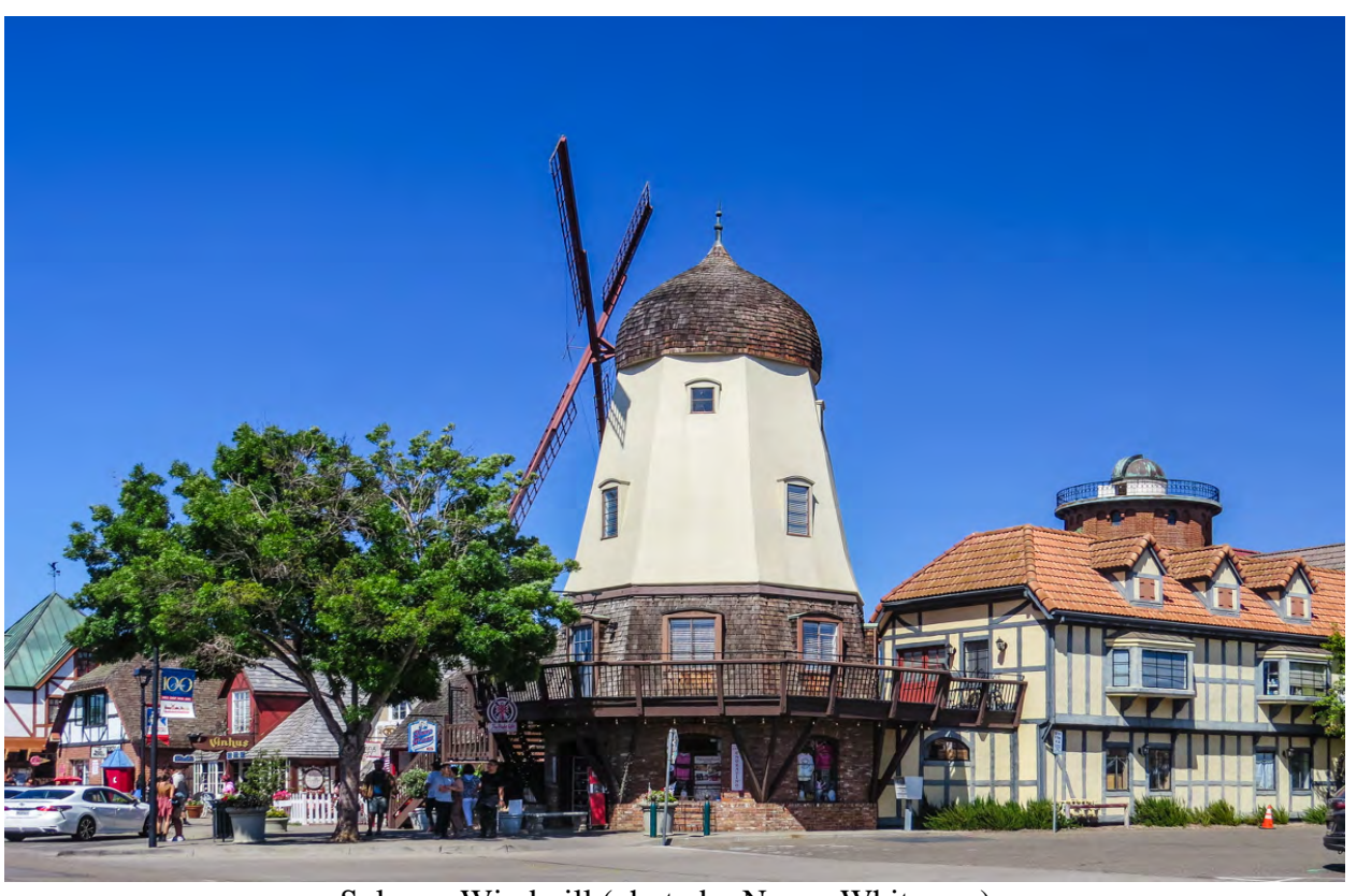
Solvang Windmill

Harry's Plaza Café menu: <a href="https://www.harrysplazacafe.com/dine-in/">https://www.harrysplazacafe.com/dine-in/</a>