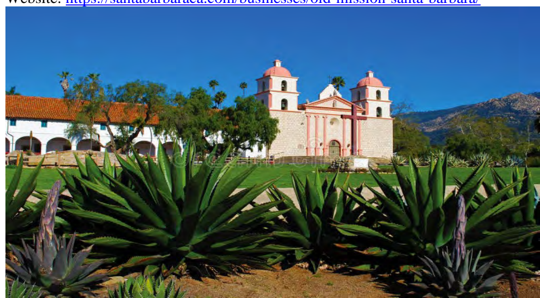
Old Mission Santa Barbara

2. Old Mission Santa Barbara - Known as the "Queen of the Missions," Old Mission Santa Barbara is a stunning piece of California's history. The candy-colored pink and white facade of the Mission is a sight to behold. Explore the beautiful gardens, the historic cemetery, and the museum that houses artifacts from the Mission's past. Website: https://santabarbaraca.com/businesses/old-mission-santa-barbara/