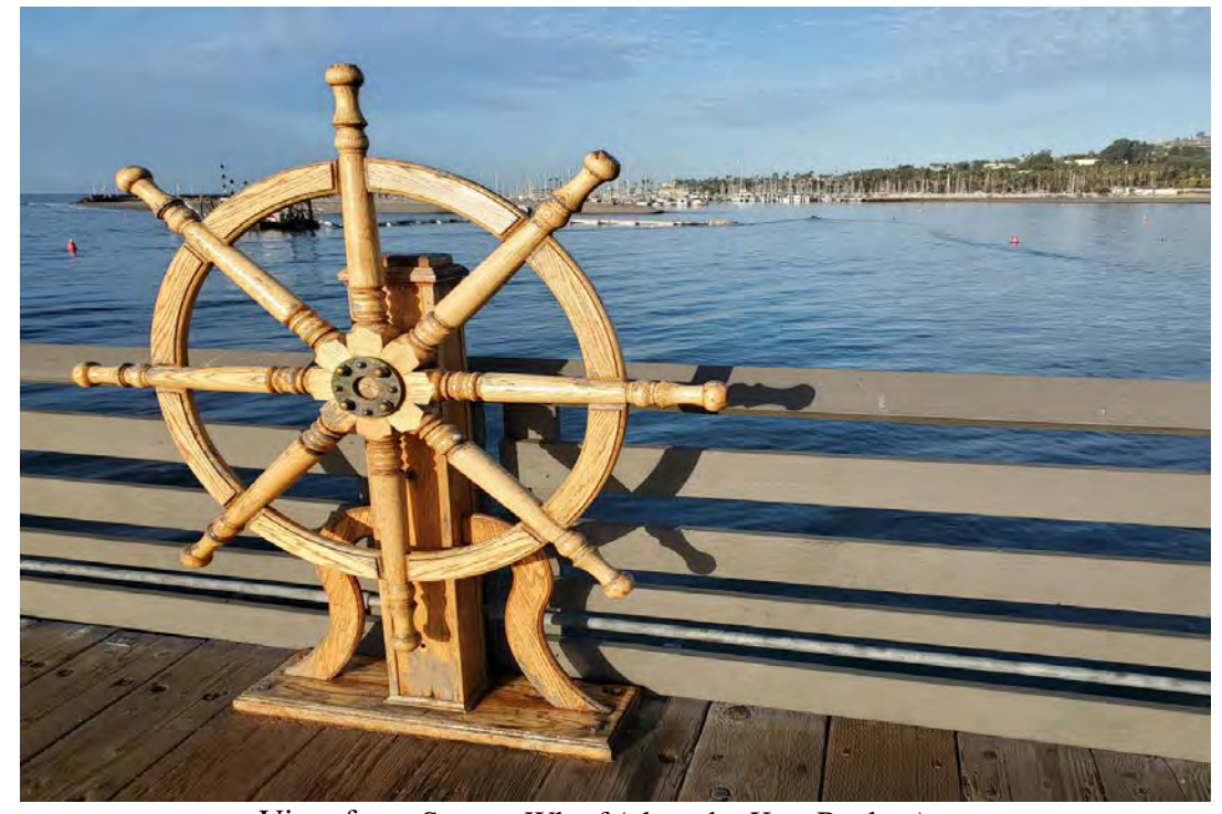
View from Stearns Wharf

PSOC will be staying at the SANDPIPER LODGE located at 3525 State Street, Santa Barbara, CA 93405. For room reservations, please call (805) 687-5326. PSOC reserved a block of 15 rooms (8 king and 7 double queen). For the Deluxe King Bed , the total for 3 nights is $589.38 (taxes included) . For the Deluxe 2 Queen Beds , the total for 3 nights is $623.58 (taxes included) . When making your room reservation, be sure to tell them you are with PSOC so you can get our special group rate. The PSOC block of rooms will be available to members until March 31, 2024. You can cancel your reservation without penalty up to 48 hours before arrival. A continental breakfast is served daily from 6:30-10:00 am. Heated pool/spa and fitness center. Check-In: 3:00 pm / Check-Out: 11:00 am. Sandpiper Lodge website: <a href="www.sandpiperlodge.com">www.sandpiperlodge.com</a>