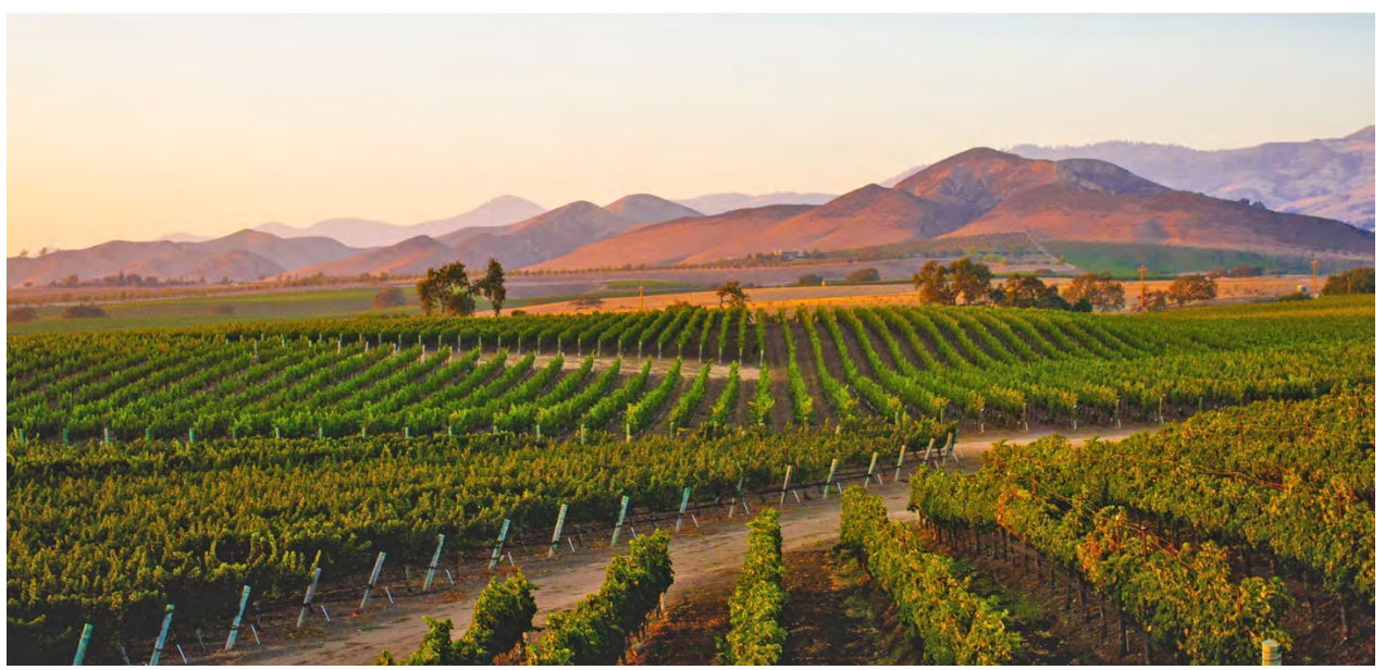
Santa Inez Valley Vineyards

Website: <a href="https://www.visitsyv.com/santa-barbara-wine-country-tours/?gclid=EAIaIQobChMIsu31776IgwMV9NTCBB1Z8gAxEAAYBiAAEgJmFfD_BwE">https://www.visitsyv.com/santa-barbara-wine-country-tours/?gclid=EAIaIQobChMIsu31776IgwMV9NTCBB1Z8gAxEAAYBiAAEgJmFfD_BwE</a>