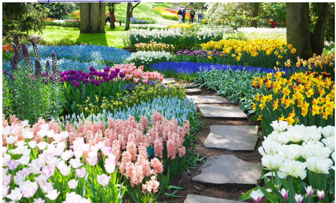
Santa Barbara Botanical Gardens

Website: <a href="https://sbbotanicgarden.org/">https://sbbotanicgarden.org/</a>